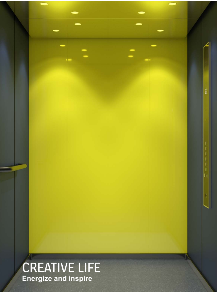
CREATIVE LIFE Energize and inspire