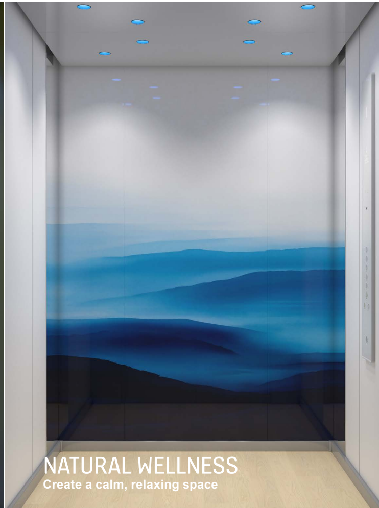
NATURAL WELLNESS Create a calm, relaxing space