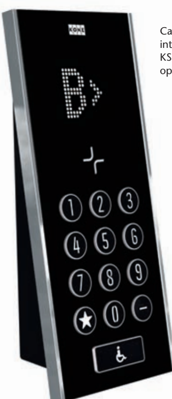
Card reader integrated with KSP 853 destination operating panel