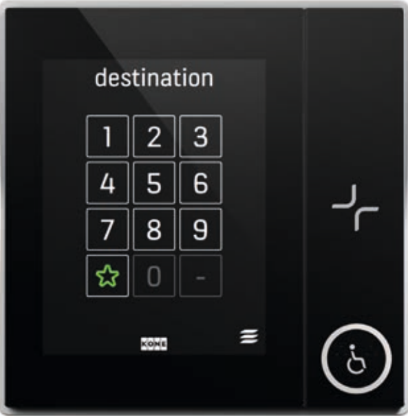
Card reader integrated with KSP 858 touchscreen destination operating panel