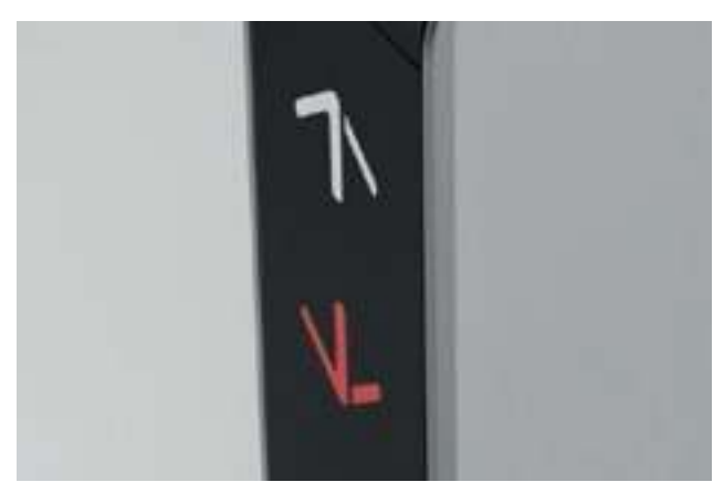
Clear illuminating arrows in front of the panel indicate access or no access passage when reader is recognized.